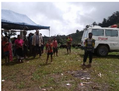
Winoko's Clinic 12 th – 14 th July 2019