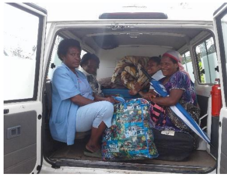
Setting up for Kainden Clinic 18 th July