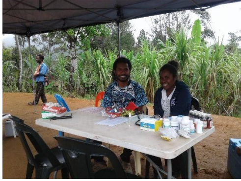
On the way to Paipalus Clinic 9 th July